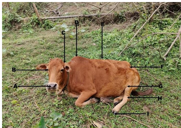
Fig.1. Photograph showing the Muzzle (A), Eye (B), Base of the ear (C), Hump(D), Dorsum (E), Tuber coxae (F), Stifle Joint (G), Hock joint (H) and Hoof (I) of Lakhimi cattle.

without the knowledge of anatomy it is quite impossible to understand and describe these phenomena. Therefore, it is evident that the knowledge of anatomy is not only required for a technical person but also is required to understand the mechanism of day-to-day activities.