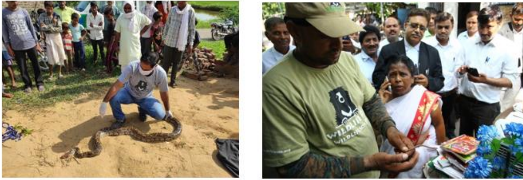
Pictures showing the role of rescue and awareness activities.