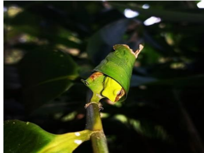
This Photo Is Taken Near The Gothra Classroom Inside Centre For Wildlife Studies.

arboreal even though seen on bushes near ponds during their breeding seasons. This photograph was taken near the paddy field located in gothra. It was taken during the end of monsoon.