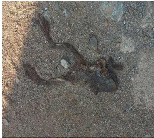
Road Kill Of A Frog Near The Entrance Gate Of Covas