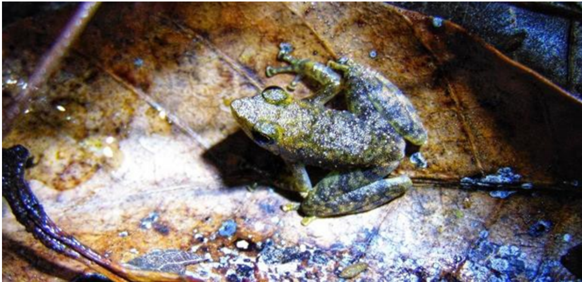
Photographed Inside The CWS Campus

(Malabar tropical frog). These are small frogs that inhabits in the evergreen forest near the rocky mountain streams. Commonly seen at an elevation of 1500 to 4500 ft. They feed on the insects that are present on the leaf litters. The abundance of frogs inside the campus indicates the balance of the ecosystem and it reminds us to conserve this vanishing life forms.