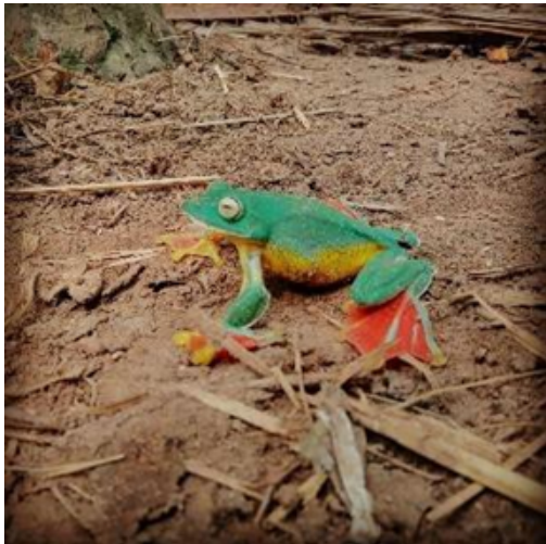
A Malabar Gliding Frog That Fell Down From A Mango Tree

There are over 6000 species of frogs in the world, in which 151 of them are found in Kerala and 136 of them endemic to western ghats. Among this 50 of them are endangered and threatened. College of veterinary and animal science University Pookode is biodiversity hotspot of large number of species. About 26 species of frogs are being identified inside the campus by the MS wildlife studies students over the time period.