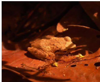
This picture is taken from the forest patch near the MH

(Charpa tree frog). Hour glass like structures are found on the dorsal side of this frog. These species of frogs are endemic to Kerala. They mainly feed on termite's ants and other insects.