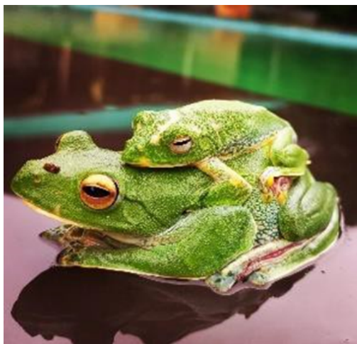
Mating of Malabar gliding frog

arboreal even though seen on bushes near ponds during their breeding seasons. This photograph was taken near the paddy field located in gothra. It was taken during the end of monsoon.