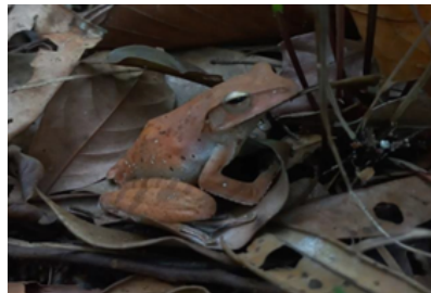
This picture is taken from the forest patch near the MH

(Charpa tree frog). Hour glass like structures are found on the dorsal side of this frog. These species of frogs are endemic to Kerala. They mainly feed on termite's ants and other insects.