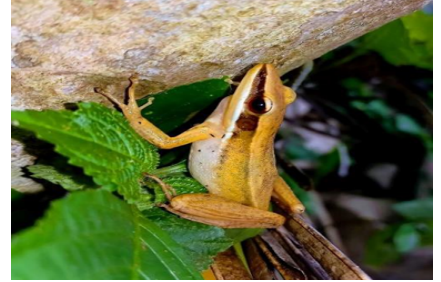
Photographed Near The Stream In Kolichal

Endemic to south and southeast Asia They inhabits these secondary and primary forests, also found near wetlands and perennial fast flowing streams. It is found at an elevation of 40 to 1145 m. their tympanum is very distinct and the thin