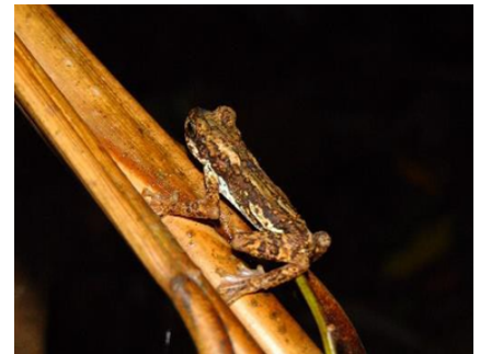
Malabar Tree Toad

Endemic to south and southeast Asia They inhabits these secondary and primary forests, also found near wetlands and perennial fast flowing streams. It is found at an elevation of 40 to 1145 m. their tympanum is very distinct and the thin